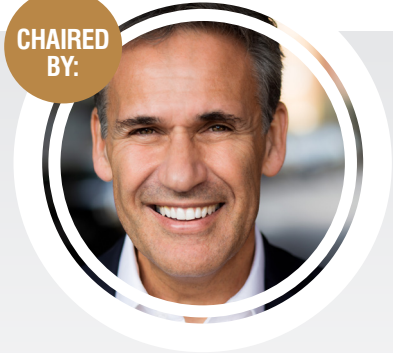
PROF. RICHARD SUSSKIND OBE

President, Society for Computers and Law